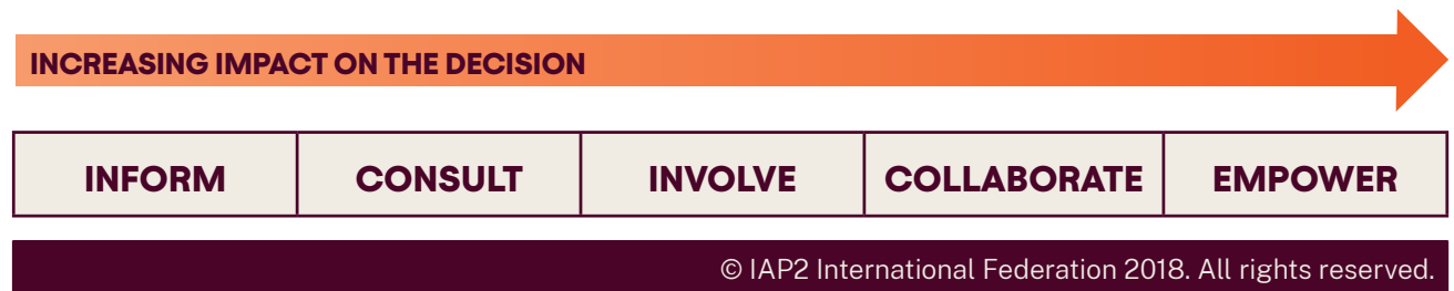
Figure 1 - IAP2 spectrum of engagement